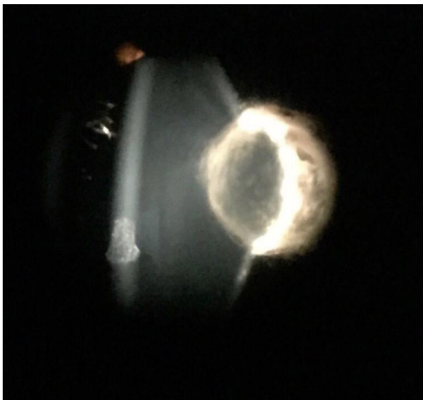
Figure 2: Posterior polar cataract associated with posterior lenticonus