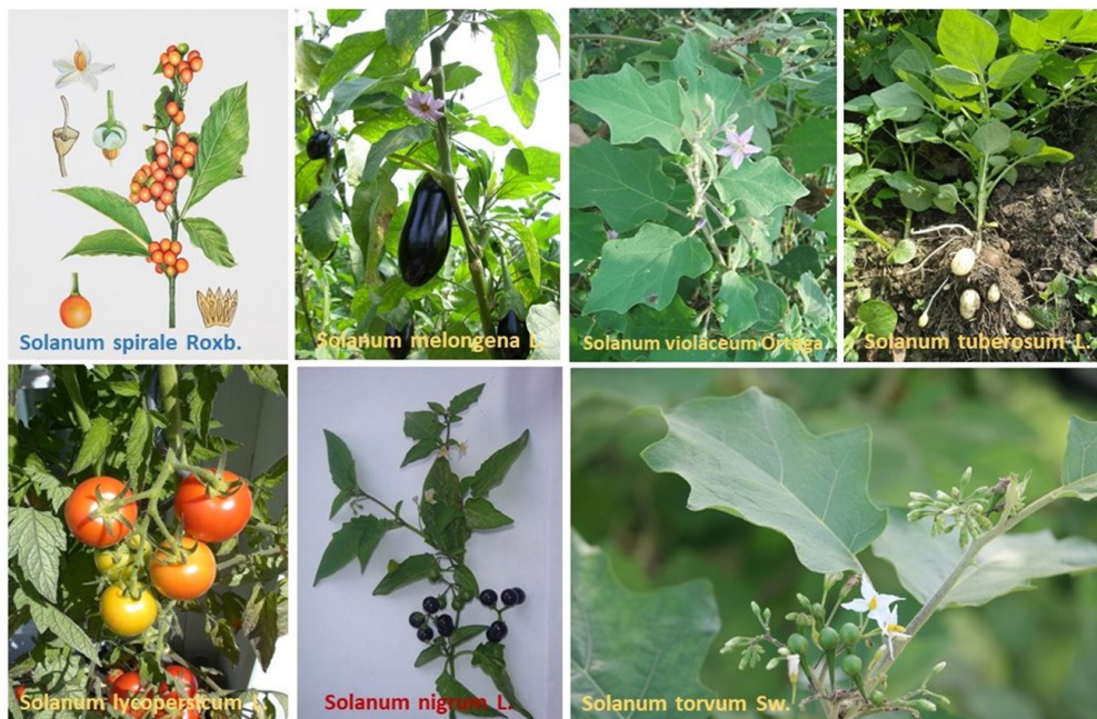
Figure 3: Photographs of the plants and parts under study.