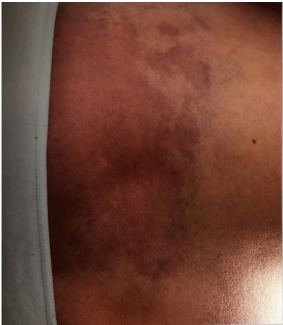
Figure 1: Posterior aspect patient's left leg showing large port wine stain characteristic of Klippel Trenaunay syndrome.

A 35 year old primip, presents to antenatal clinic when she is 35 weeks pregnant. She had forgotten to disclose a known diagnosis of Klippel Trenaunay Syndrome at booking and subsequently was reviewed later in pregnancy by the consultant team. On examination the patient's right leg had prominent veins and a large port wine stain extending up to the buttock and lumbar spine. She had previously undergone vein stripping in 2012 at a tertiary unit, where a diagnosis of KTS was made based on her clinical presentation and histology post-procedure. Her past medical history is otherwise unremarkable. Since her diagnosis the patient has been wearing compression stocking daily.