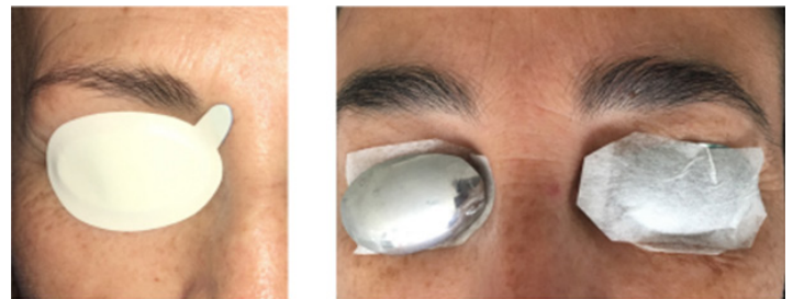
Figure 3: A- A commercial disposable eye shield that has a thin aluminum layer. B- Eye shields fixed with the tape during high light exposure procedures. The contour of the tape can be trimmed to an oval shape.