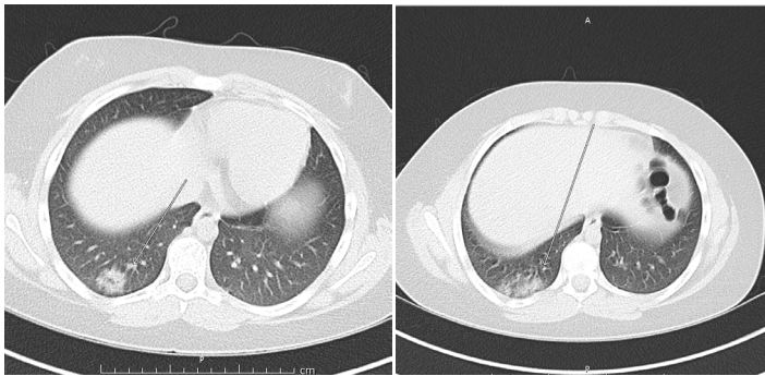
Figure 1a,1b: 12 year old girl. It was observed that opacity in ground glass density in the posterior basilar segment of the right lower lobe increased in size after 5 days. There were no other accompanying thoracic findings.

For CT imaging findings; The lesion density was heterogeneous, accompanied by ground-glass opacities and pleural thickening (Figure 1A). 12 year old girl. After 5 days, the opacity in ground glass density in the posterior basilar segment of the right lower lobe increased in size. (Figure 1B). There were no other accompanying thoracic findings in chest CT imaging of this 12 years old girl patient.