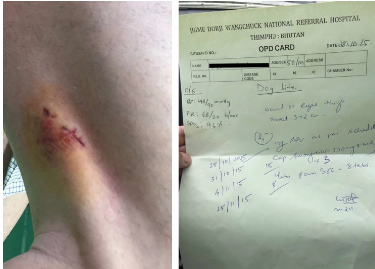
Figure 1: Information e-mailed from Bhutan by Patient 3 on the day of the dog bite (October 28, 2015). (Left) Bite on back of right thigh. (Right) Medical documentation of clinic examination, care rendered, 2-site vaccine injection on day 0 (28/10/15) and 2-site injection vaccination schedule for days 3, 7 and 28.

Figures 1 and 2: Rabies Exposures in International Travelers (Henry W. Murray, M.D.).